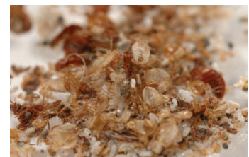
Bed Bug waste

In extreme cases, you may need to call an exterminator and also may have to get rid of the affected mattress or furniture.